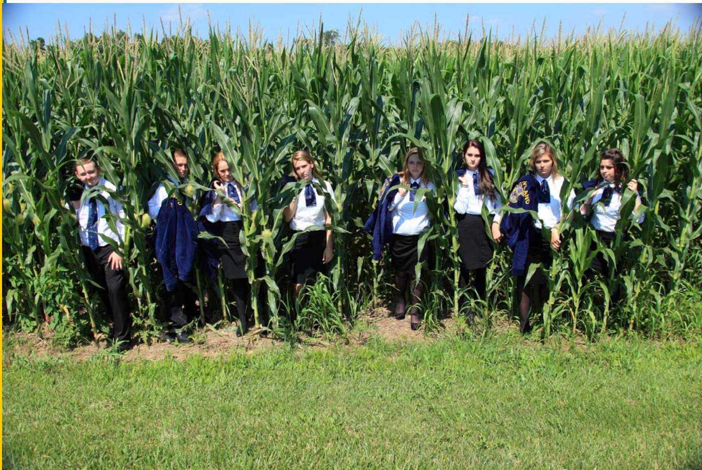
Children of the corn